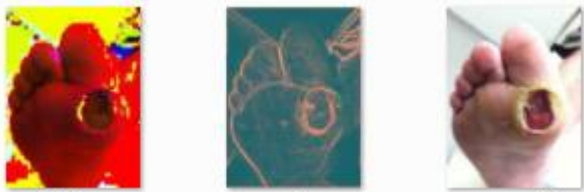
Figure 3: Detected after LAB and segmentation